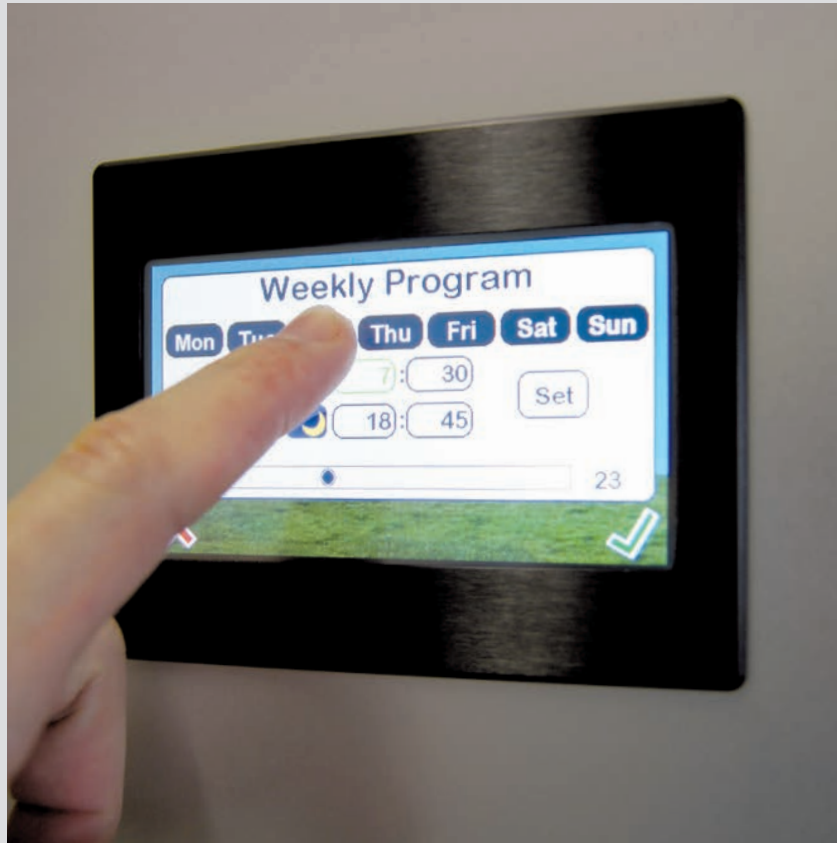
Easy touch screen interface